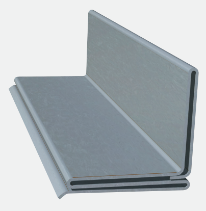
Standing S Cleat profile - 136mm