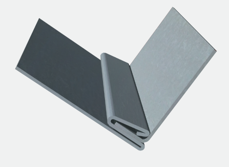
Button Punch / Snaplock profiles after seaming, joining 2 edges at 90 degrees