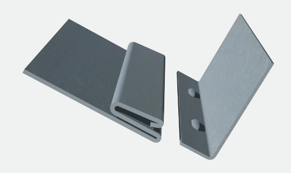
Button Punch / Snaplock profiles before seaming

The female roll set incorporates automatic material gauge compensation, to ensure tight seams are formed on all material gauges. The female profile has a pocket depth of 14mm and uses 35mm of material.