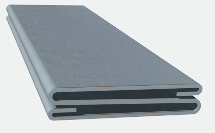
S Cleat profile - 92mm

The Standing S Cleat has 12 stations with the option to fit up to 2 of the 11 available roll sets. See table on page 7.